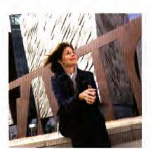
At Belfast's recently opened Titanic Centre